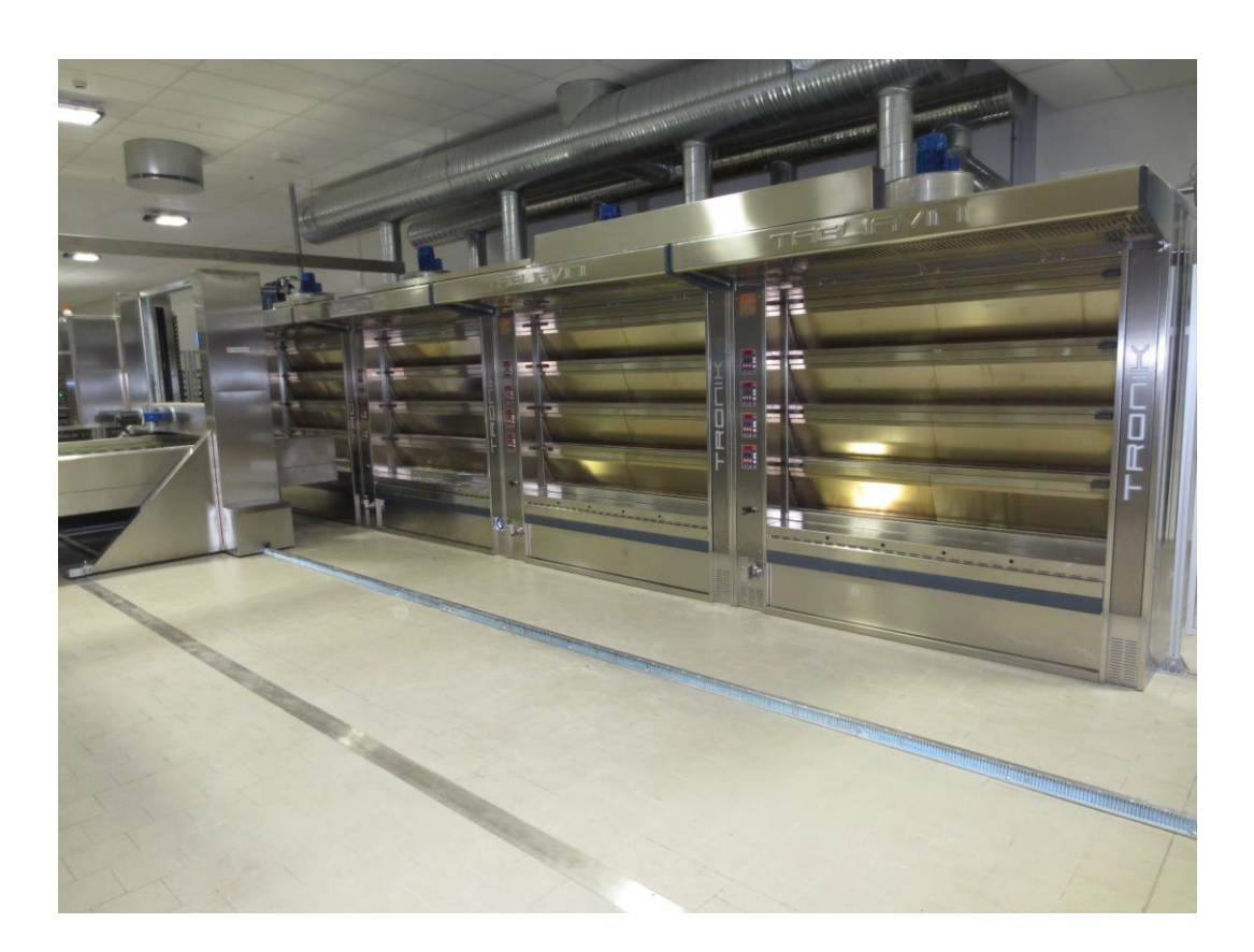
n.4 Tronik deck ovens served by a Robot Loader, with boards pre loading and automatic unloading on accumulation belt